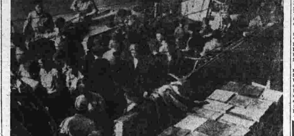
Captured German seamen are transferred from a U. S. PT boat to a Canadian assault craft off the coast of France. An American destroyer sank their ship.